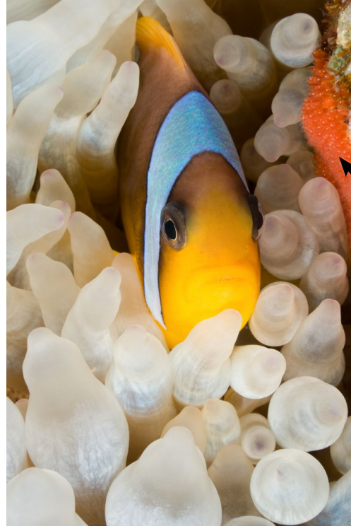
clown fish offspring

Sea anemones need clown fish to help protect them from other organisms that would eat them.