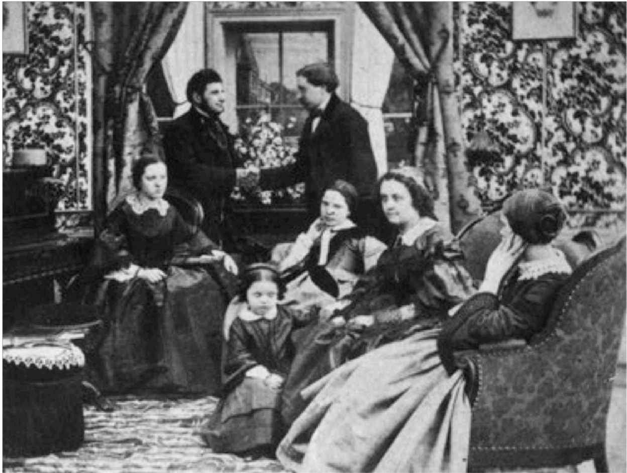
A Victorian family circa 1860

If you're like many Americans, you have just spent a few days in close quarters with your parents, grandchildren, siblings, etc. You're ready to go home, or ready for them to go home. But for a growing number of families in which adult children can't afford to live on their own, this is the new normal.