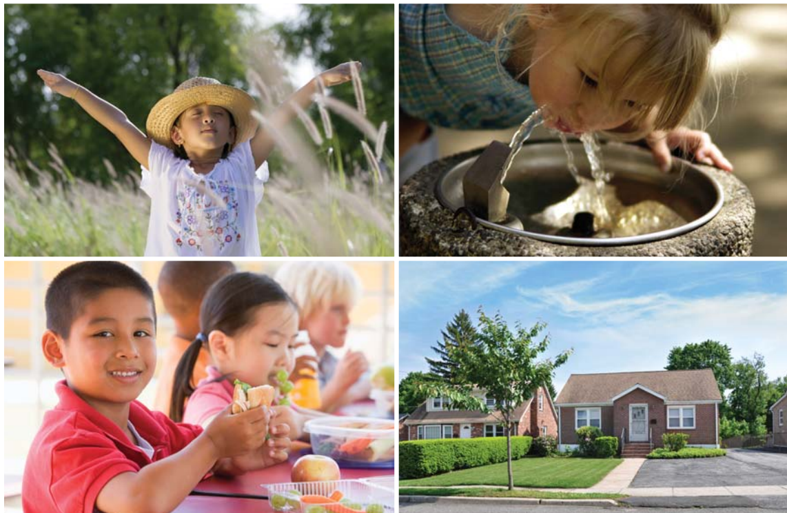
These things are called basic needs.

Hopefully, you said air to breathe, water to drink, food to eat, and shelter to protect you!